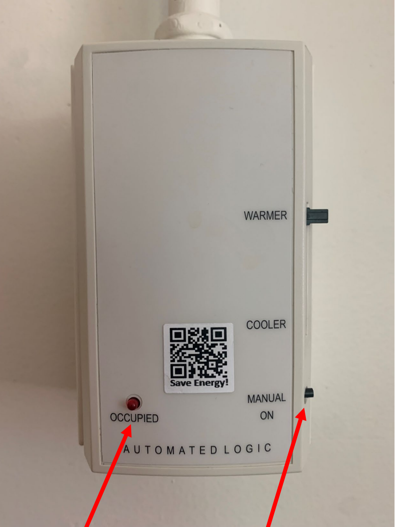
LED off, room is unoccupied.