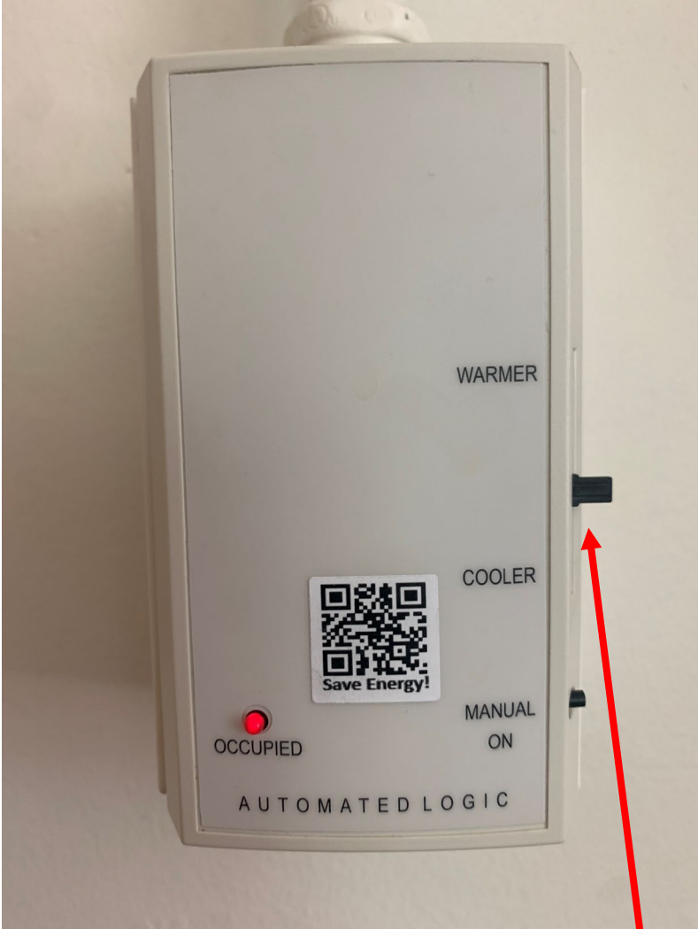
Notice the slide is halfway between the warmest and coolest setting. This will place the set point in the default set points of the system. 69 for heating, 78 for cooling.